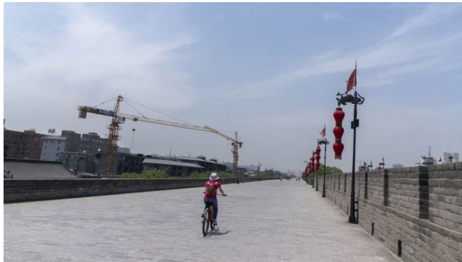
A cyclist passes by construction cranes in Xi'an, China, a starting point of the New Silk Road.

In 2013, Chinese President Xi Jinping announced the launch of both the Silk Road Economic Belt and the 21st Century Maritime Silk Road, infrastructure development and investment initiatives that would stretch from East Asia to Europe. The project, eventually termed the Belt and Road Initiative (BRI) but sometimes known as the New Silk Road, is one of the most ambitious infrastructure projects ever conceived. It harkens back to the original Silk Road, which connected Europe to Asia centuries ago, enriching traders from the Atlantic to the Pacific.